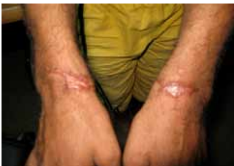
Profile 3 photo 2. Anterior view of severe abrasions and lacerations to left and right wrists. (Photo on file with PHR)