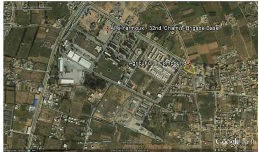
Khalat Al Forjan and Yarmouk 32nd Brigade Military Base — Google Earth Image from 19 August 2011