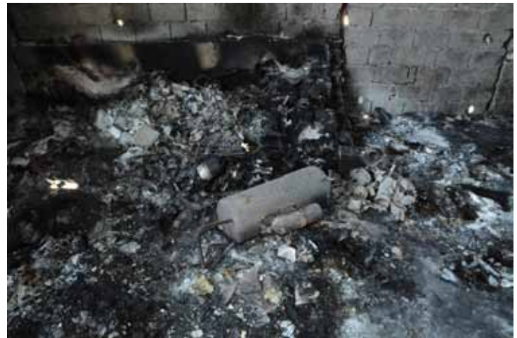
Picture 8. Possible charred fire extinguisher. [PHR Forensic Crime Scene Report, photo DSC_527, supra note 2]

Later that night, Harizi told Laskhar to ensure there were no survivors among the detainees. 124 Laskhar arrived at the compound at 11:00 p.m. and proceeded to search for detainees who had survived the initial attacks. With a flashlight he inspected wounded men who lay on the ground inside the warehouse and others who had apparently escaped but were still within the walled compound. Laskhar reported that he had executed 12 detainees with his nine-millimeter