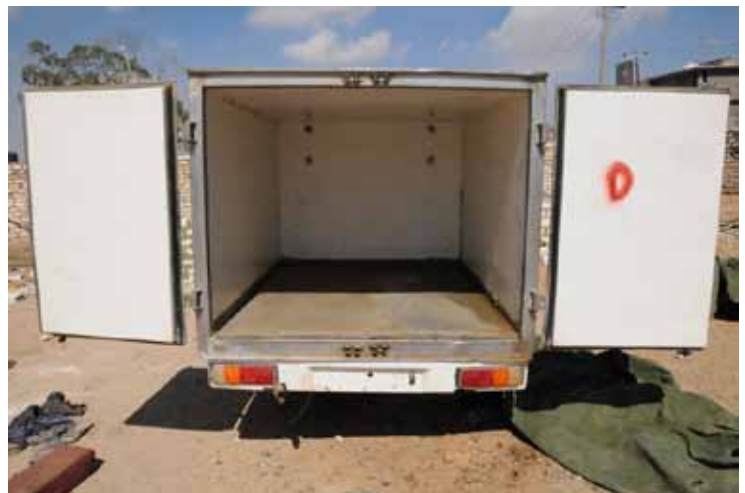
Picture 2. This Isuzu pickup truck with a smaller insulated box - interior height 1.26 meters - was parked close to the warehouse. It is likely the “fridge” Mohammad was placed in after having been beaten by guards. (see page 17). (PHR Forensic Crime Scene Report, photo DSC_0556, supra note 2)

They also reported that these box-like detention facilities were too small in which to sit or stand. 75 Torture and solitary confinement alternated for several days. 76 Subsequent transfer to cramped detention in a slightly larger container inside the same compound usually followed before a detainee was finally moved into