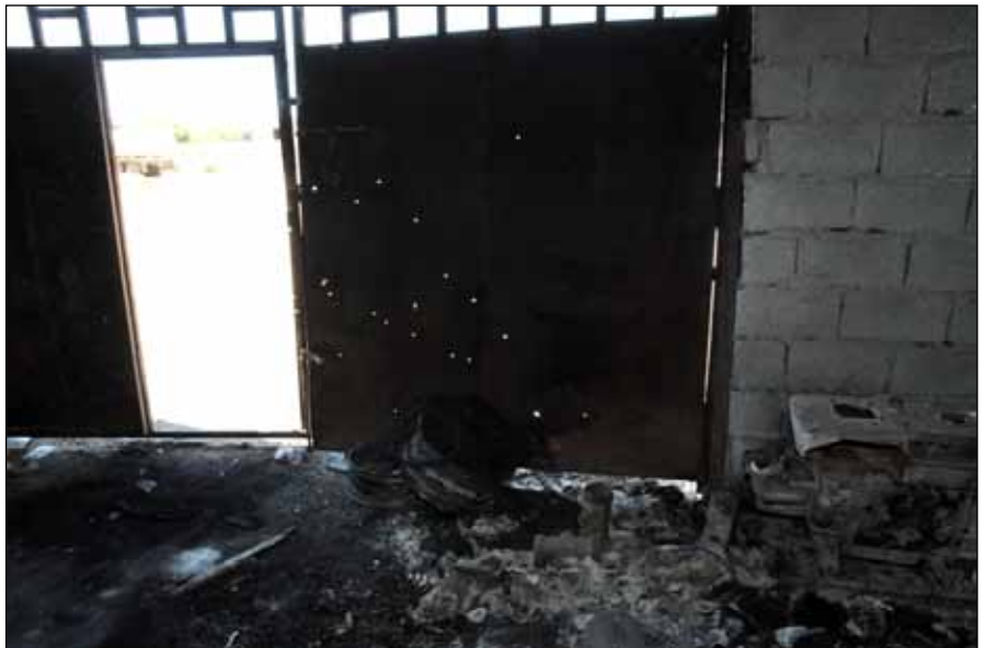
Picture 6. The damage to the metal gate in this photo is consistent with at least 21 suspected gunshots entering from the outside through the padlocked metal gate and into the warehouse room. (PHR Forensic Crime Scene Report, photo DSC_0526, supra note 2).

The same two 32 nd Brigade soldiers stepped outside and began firing their automatic weapons through the thin metal gate at the reported 153 detainees trapped inside the ware-