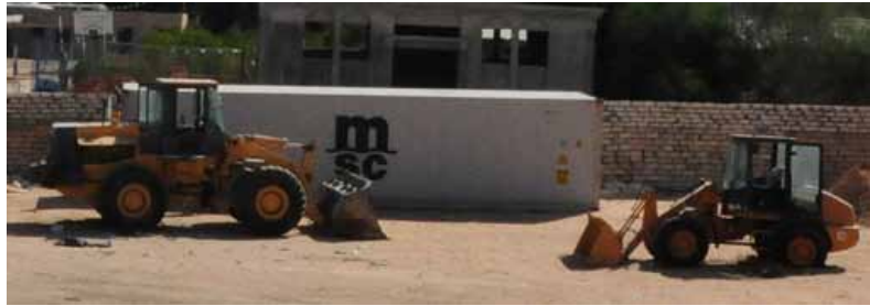
Picture 3. Empty white refrigeration transport container with the logo "msc" located inside the Compound. (PHR Forensic Crime Scene Report, photo DSC_0418, supra note 2)

Surviving detainees gave highly consistent accounts of inhuman conditions inside the warehouse with no sanitation, little food, and scarce water. They also reported a lack of medical care for the severely wounded, sexual violence and rape, deaths from torture, and eyewitness accounts of the massacre on 23 August.