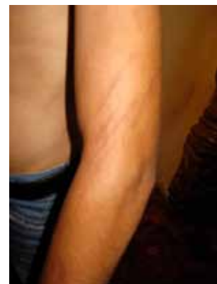
Profile 1 photo 1. Healed linear hypertrophic, hyper-pigmented lacerations on left biceps, lateral view. (Photo on file with PHR.)

The wounds have since healed by secondary intention (i.e., when wound edges are