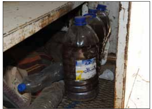
Picture 5. Suspected urine jugs into which detainees relieved themselves, found in the personnel carrying box of the Mitsubishi truck. (PHR Forensic Crime Scene Report, photo DSC_0579, supra note 2)

Inside the walled compound, soldiers used an agricultural shed to detain together up to 153 men, approximately 120 of whom were reported to be civilians. 85 This enclosed warehouse of rusting corrugated metal and cinder blocks measured roughly 120 square meters. The condi-