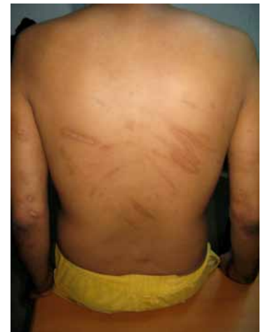
Profile 3 photo 1. Posterior view of multiple broad, linear, “tram-track” scars on upper, middle, and lower back.

He has decreased tone and stability of both shoulder joints and has neuropraxia and paresthesias (numbness, tingling, or a “pins and needles” feeling) in both arms. This condition has resulted in some cramp-