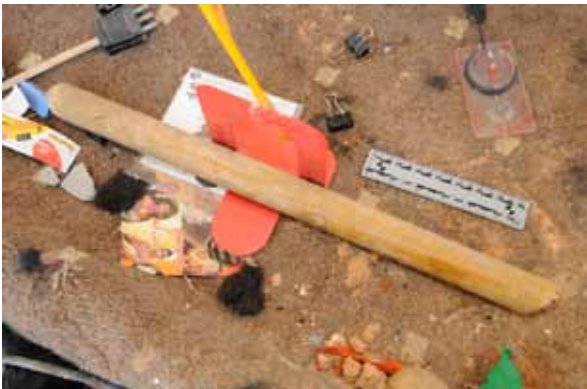
Picture 4. Wooden handles with suspected blood stains, possibly implements used to beat detainees at the Agricultural Compound. (PHR Forensic Crime Scene Report, photo DSC_0611, supra note 2)