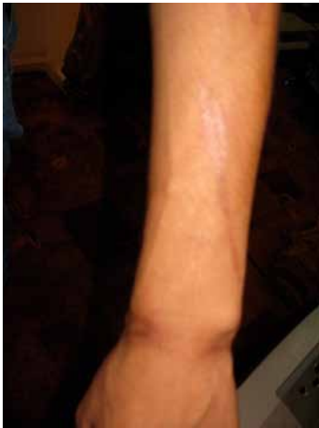
Profile 1 photo 3. Anterior view of ligature scars on left wrist and healed single laceration on the left lateral forearm. (Photo on file with PHR).

Mohammad described severe pain and inability to chew following blunt injury to his jaw, which is highly consistent with a broken jaw. He continues to suffer some discomfort when chewing and has some temporomandibular crepitus 143 when opening his mouth. While he does not appear to have obvious malocclusion, he has several missing and broken teeth that he indicated are from the same beating that resulted in his broken jaw.