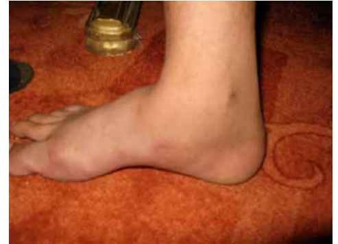
Profile 1 photo 2. Medial view of significant edema (swelling) of the right foot.

Mohammad also has ligature scars on both wrists and complains of persistent numbness in the ulnar nerve distribution, most likely as a result of a neuropraxia 142 from the severe pressure on his ulnar nerve at the level of the wrists.