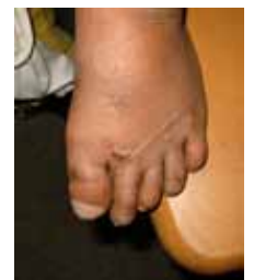
Profile 3 photo 3. Superior view of severe edema, venous hypertrophy, and scar tissue on dorsal surface of left foot.