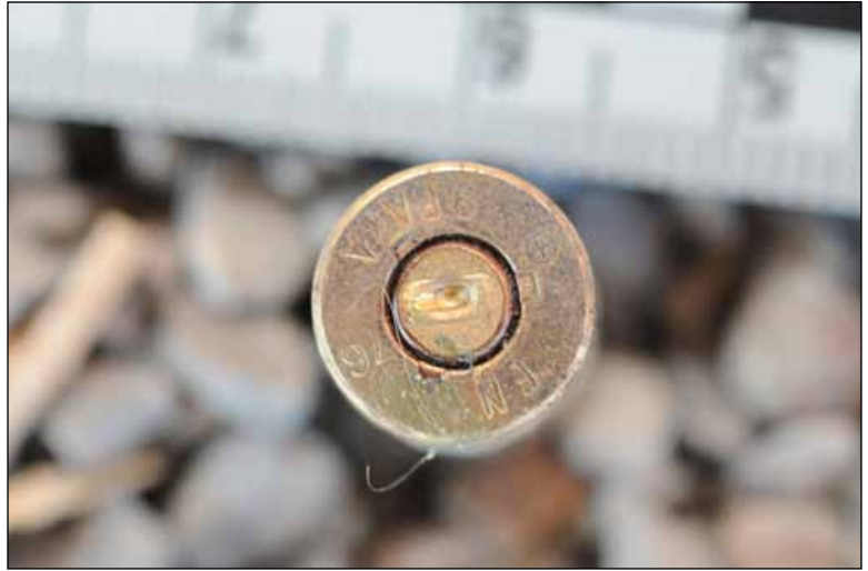
Picture 9. One 9mm cartridge casing with a percussion impression, consistent with having been discharged from a Glock pistol, was documented on the ground immediately outside of the warehouse entrance door on 9 September 2011. (PHR Forensic Crime Scene Report, photo DSC_684, supra note 2)

Mohammad reported the following account: he and 17 other escapees hid near a house behind the compound and witnessed the events that took place next. 127 He saw two detainees still within the compound bring water to the injured inside the warehouse. The soldiers who had tracked down the men who had tried to escape out the main entrance came back and shot these two detainees. He saw a soldier shoot wildly with a machine gun. He saw the soldier named Laskhar hunt down survivors with a flashlight and execute them with his nine-millimeter pistol. According to Mohammad, two Tuareg 128 soldiers as well as two black African soldiers (possibly from Mali or Niger, he said) combed the area looking for survivors. Some soldiers turned on the headlights of cars parked in the compound, apparently to aid them in finding any survivors. 32 nd Brigade soldiers then pulled two trucks in front of the warehouse and piled bodies into them.