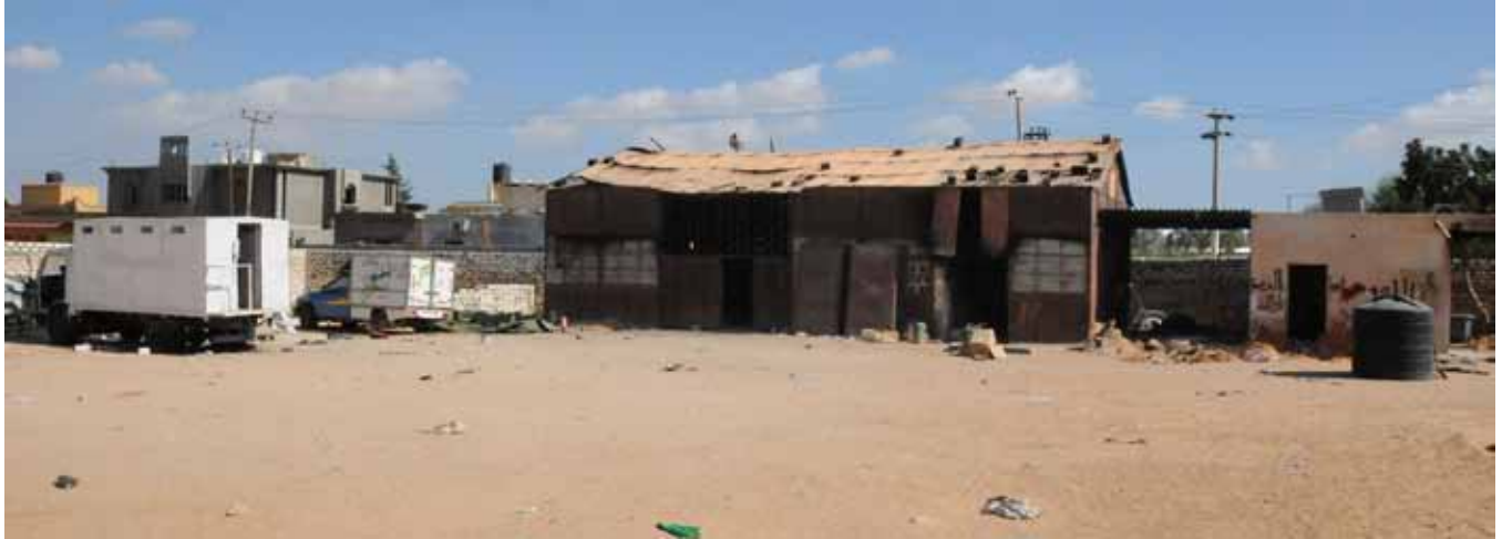
Picture 1. Warehouse inside Agriculture Compound with Isuzu pickup truck [smaller insulated box] parked close to the building; Mitsubishi Personnel Transport Truck on the left. These are two of the vehicles in which detainees were allegedly abused/tortured. (PHR Forensic Crime Scene Report, photo DSC_0399, supra note 2)