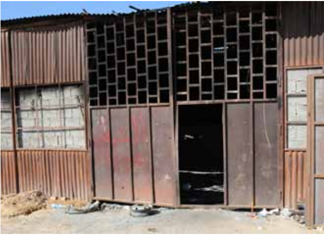
Picture 7. Agricultural Compound warehouse entrance showing rusted metal façade. [PHR Forensic Crime Scene Report, photo DSC_0621, supra note 2]

house. 111 Mohammad saw men cower and run in chaos. He witnessed many get shot and die. He then saw grenades land inside the warehouse, which the soldiers had thrown through the openings high above the main door. 112 Omar believed the soldiers threw seven grenades into the warehouse, and more men died from the explosions. 113