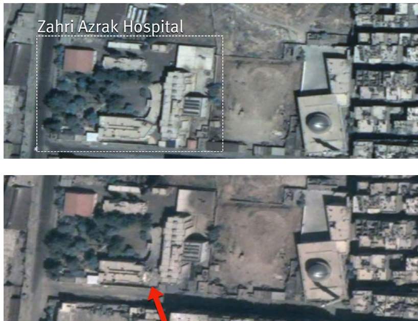
Zahri Azrak Hospital, located in the Trab al-Hellok neighborhood in Aleppo city, was attacked on August 25, 2012. The American Association for the Advancement of Science (AAAS) obtained imagery of the hospital that was collected on August 18, 2012 and September 1, 2012, just days before and after the reported attack. The before and after images clearly show damage to the rear entrance of the southern wing of the hospital. The damage observed is consistent with shelling.

sustaining several mortar and aerial assaults by Syrian government forces.