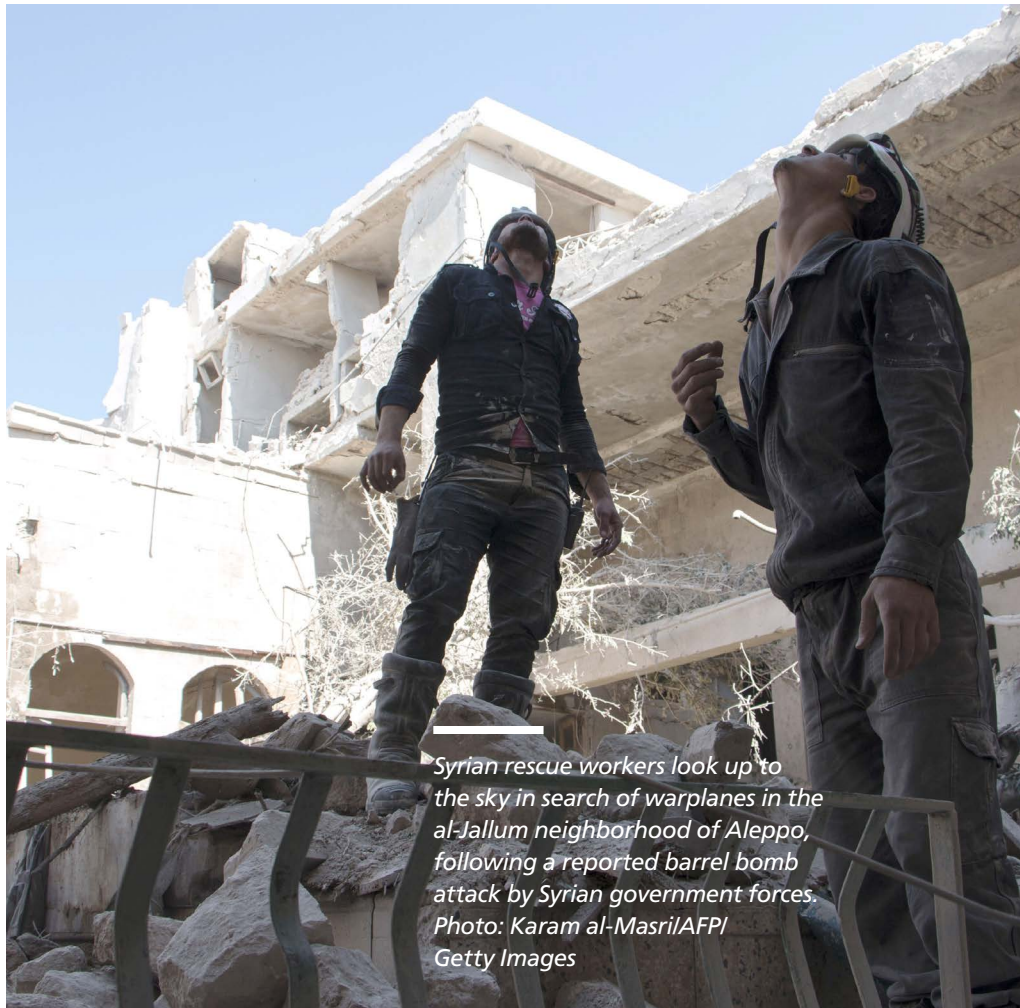
Syrian rescue workers look up to the sky in search of warplanes in the al-Jallum neighborhood of Aleppo, following a reported barrel bomb attack by Syrian government forces.

Barrel bombs are a crude, low-cost weapon made by filling empty barrels or cylinders with explosives, shrapnel, nails, and oil and dropping them from helicopters. These weapons weigh between 200 and 2,000 pounds and can decimate an entire city block. They are indiscriminate and extremely destructive, as they tumble through the air and break into thousands of fragments upon impact, resulting in an enormous blast radius. They annihilate anything and anyone in their path, tearing flesh apart and leaving just body parts in their wake. In addition to the physical destruction, barrel bombs have a tremendous psychological impact on those living in their path. There is no way to protect oneself from them; residents live in constant fear of blue skies, which often bring barrel bomb assaults.