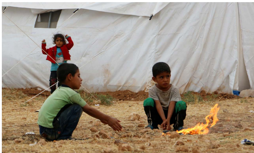
Children in front of tents housing displaced Syrians in a camp on the outskirts of Aleppo. Tens of thousands of Syrians have fled their homes in Aleppo since a government offensive there began on October 17, 2015 backed by Russian airstrikes.

The Russian Ministry of Defense announced that as of November 3 its aircraft had carried out a total of 1,631 combat sorties targeting IS and terrorist locations. 143 Analysis by The Carter Center, however, illustrates that 85 percent of Russian airstrikes targeted areas controlled by opposition groups, rather than by IS. 144 The Russian government appears to be following President Assad's lead in labeling all opposition groups as terrorists and attacking them and their civilian supporters. The Russian military has also followed in the Syrian military's footsteps by attacking the health care system, an explicit violation of IHL. Through the end of October, PHR has documented 10 attacks on medical facilities by Russian airstrikes in Syria. 145 While PHR has not documented any Russian airstrikes on medical facilities inside Aleppo city through October 31, PHR has documented five attacks on facilities in the city's suburbs and southern countryside. Four of these medical facilities were forced to close following the attacks. These airstrikes were launched alongside a ground offensive by the Syrian government and