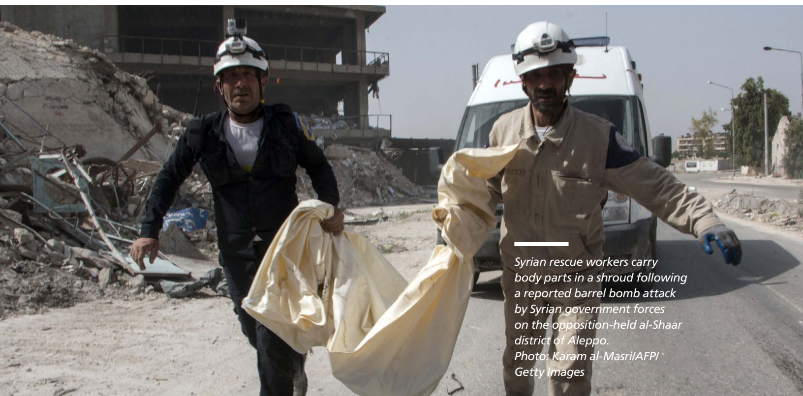
Syrian rescue workers carry body parts in a shroud following a reported barrel bomb attack by Syrian government forces on the opposition-held al-Shaar district of Aleppo.