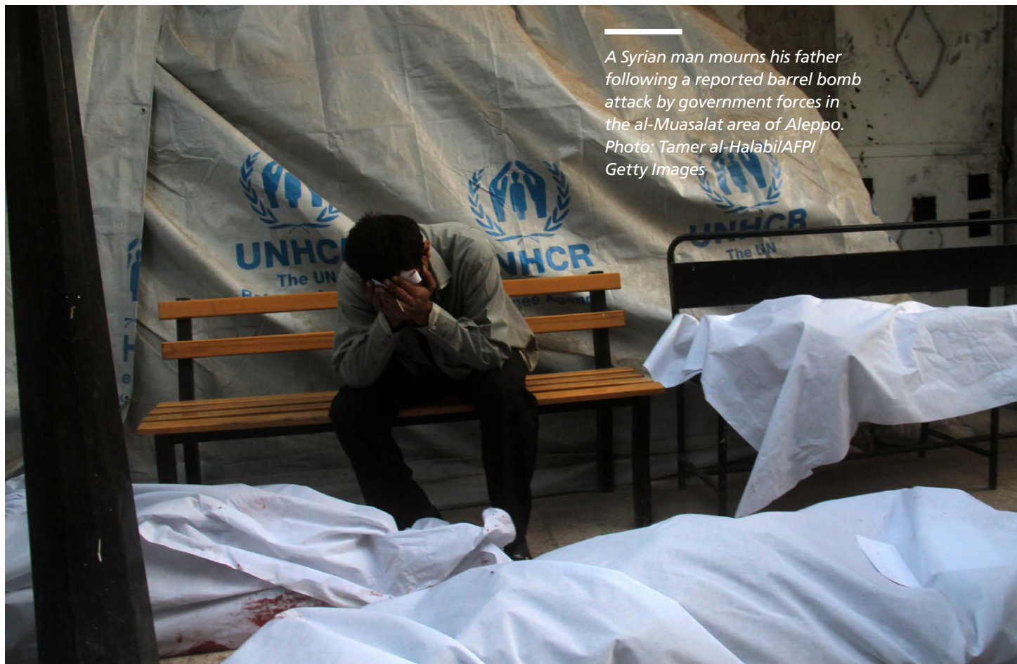
A Syrian man mourns his father following a reported barrel bomb attack by government forces in the al-Muasalat area of Aleppo.

Given the failure of the UN Security Council to refer the situation in Syria to the International Criminal Court, support other credible justice initiatives to ensure that perpetrators of war crimes and crimes against humanity are held accountable. These initiatives could include the creation of an ad-hoc or special court and the prosecution of appropriate cases under universal jurisdiction.